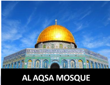
AL AQSA MOSQUE