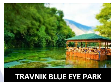
TRAVNIK BLUE EYE PARK