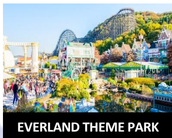
EVERLAND THEME PARK