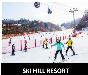
SKI HILL RESORT