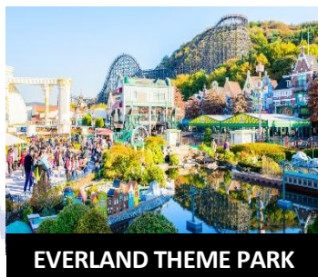
EVERLAND THEME PARK