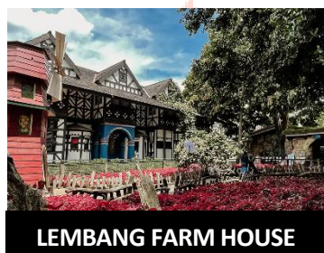
LEMBANG FARM HOUSE