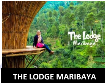
THE LODGE MARIBAYA