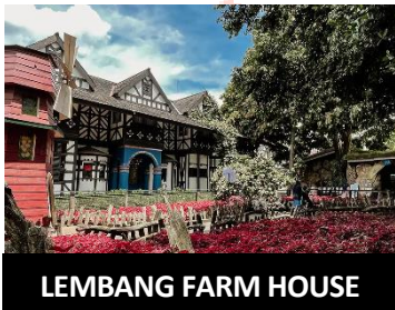
LEMBANG FARM HOUSE

[ 1 Nights in Bandung & 1 Nights in Jakarta ]