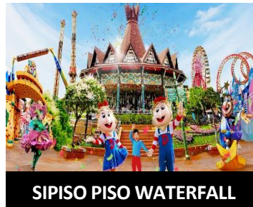
SIPIISO PISO WATERFALL