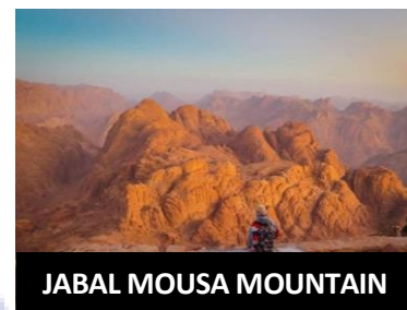
JABAL MOUSA MOUNTAIN