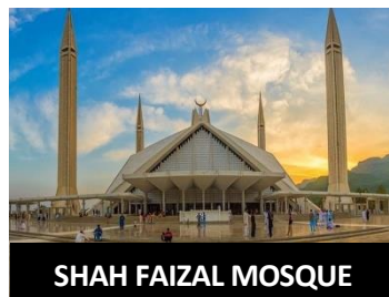
SHAH FAIZAL MOSQUE