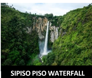
SIPI SO PISO WATERFALL