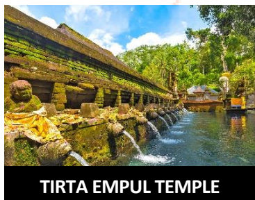
TIRTA EMPUL TEMPLE

KUALA LUMPUR – BALI – KINTAMANI VOLCANO – TANAH LOT TEMPLE