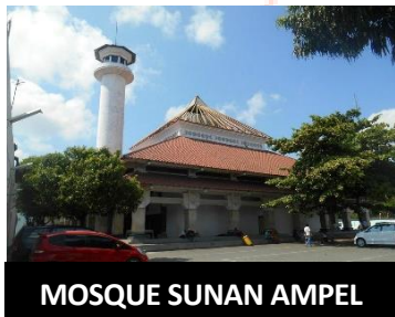
MOSQUE SUNAN AMPEL