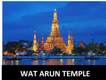
WAT ARUN TEMPLE