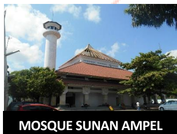
MOSQUE SUNAN AMPEL