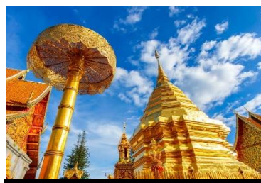
DOI SUTHEP TEMPLE