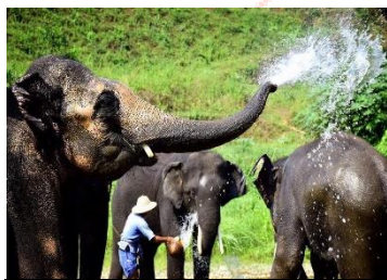
MAE THAENG ELEPHANT