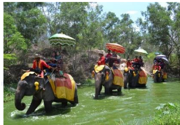
CHANG PUAK CAMP