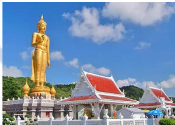
SONGKHLA CITY PARK